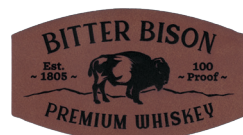
Buckle - Wide 3.5" x 2"