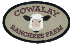
Oval - Large 3.75" x 2.25"