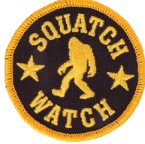
Circle - Large 2.5" x 2.5"