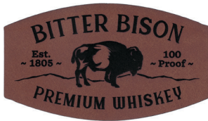
Genuine Leather Patch