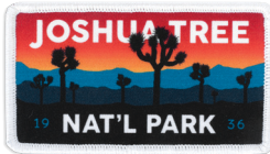
Flag 3.5" x 2"