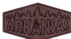
Hex - Wide 3.5" x 2"