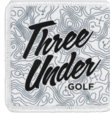
Square - Large 2.5" x 2.5"