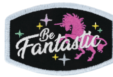
Buckle - Wide 3.5" x 2.25"