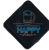
Diamond 2.5" x 2.5"