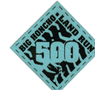
Diamond - Small* 2" x 2"