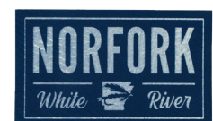
Flag 3.5" x 2"