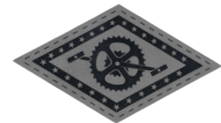
Diamond - Wide 3.5" x 2"