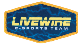
Hex - Wide 4" x 2.25"