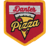
Badge 2.25" x 2.5"