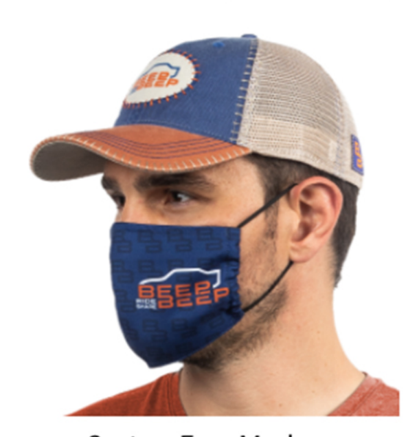
Custom Face Masks Full-Color Sublimated. Individually Packaged.