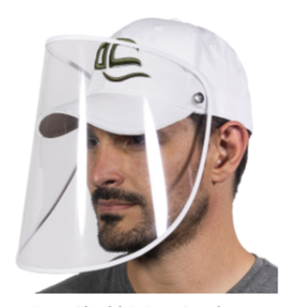
Face Shield & Cap Combo A snap-on, removable PET face shield that attaches to a custom import cap.

These PPE items are not for use in surgical setting or where significant exposure to liquid, bodily, or any hazardous fluids may be expected. Not for use in clinical setting where infection risk level through inhalation exposure is high. Not for use in presence of high intensity heat source or flammable gas.