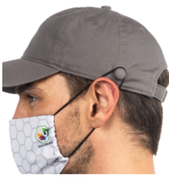
Side Buttons Attachment Relieves Ear Fatigue. Available in our overseas custom programs.