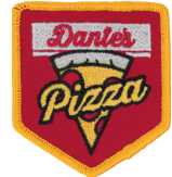
Badge 2.25" x 2.5"