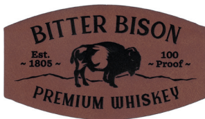
Genuine Leather Patch