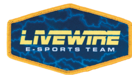
Hex - Wide 4" x 2.25"