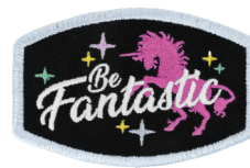
Buckle - Wide 3.5" x 2.25"