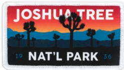
Flag 3.5" x 2"