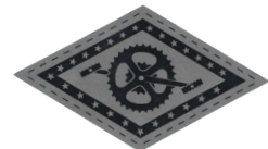
Diamond - Wide 3.5" x 2"