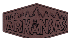
Hex - Wide 3.5" x 2"