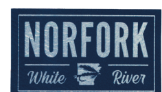
Flag 3.5" x 2"

* Front Left Wear Side and Front Right Wear Side available in these shapes