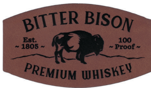
Genuine Leather Patch