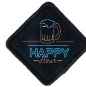
Diamond 2.5" x 2.5"