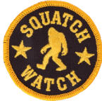
Circle - Large 2.5" x 2.5"