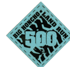
Diamond - Small* 2" x 2"