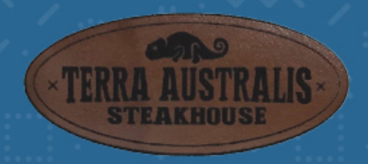
Oval - Small 3.5" x 1.5"