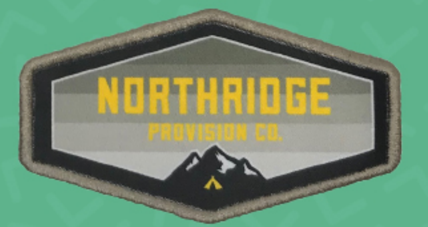
Hex - Wide 4" x 2.25"