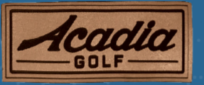
Rectangle - Medium 3.5" x 1.5"