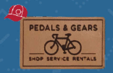
Rectangle - Small 2" x 1.25"