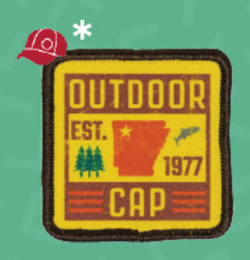
Square - Medium 2" x 2" Sublimated Only