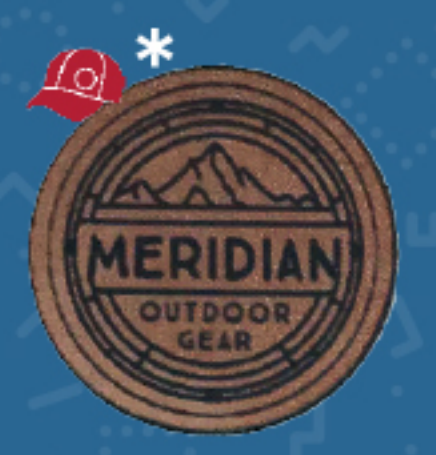
Circle - Small 2" x 2"