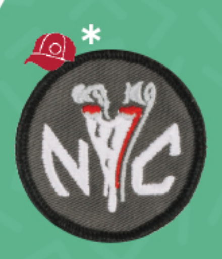
Circle - Small 2" x 2" Sublimated Only