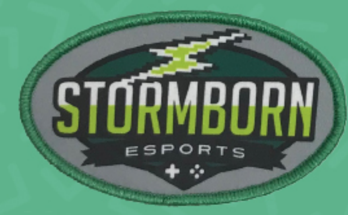
Oval - Large 3.75" x 2.25"