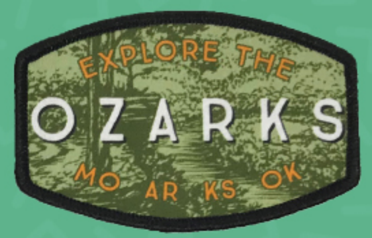
Buckle - Wide 3.5" x 2.25"