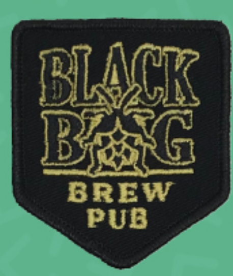
Badge 2.25" x 2.5"