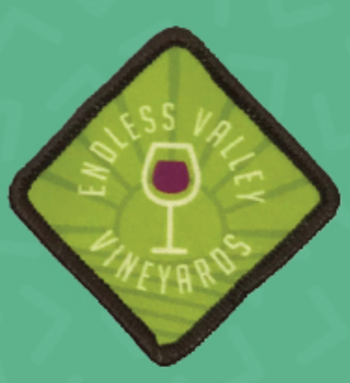
Diamond 2.5" x 2.5"