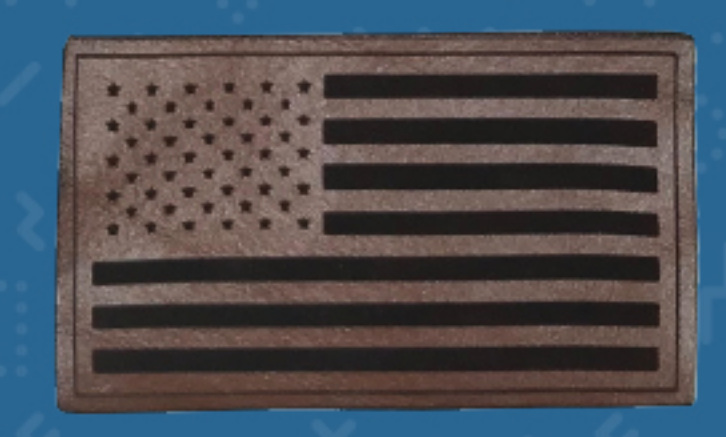
Flag 3.5" x 2"