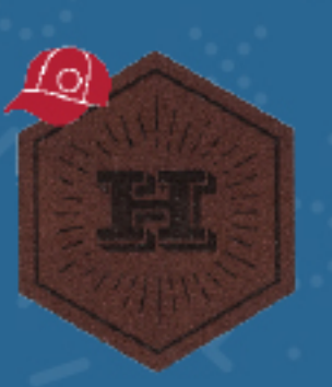
Hex - Small 1.5" x 1.75"