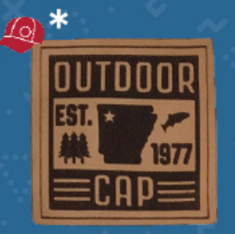
Square - Medium 2" x 2"