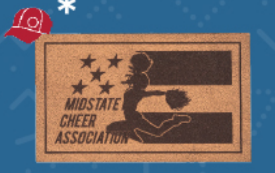
Rectangle 2.5" x 1.5"