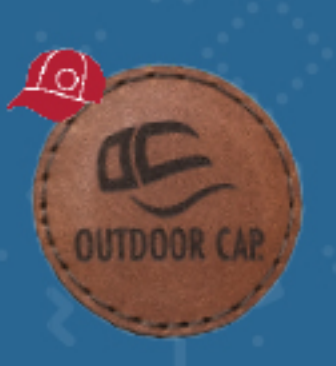
Circle - Mini 1.5" x 1.5"