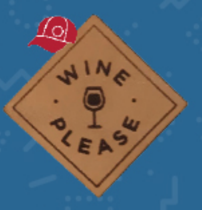
Diamond - Small 2" x 2"