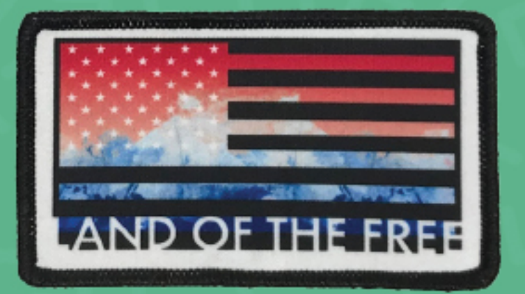
Flag 3.5" x 2"