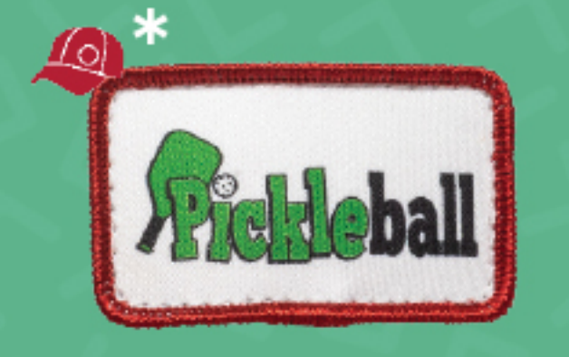
Rectangle 2.5" x 1.5" Sublimated Only