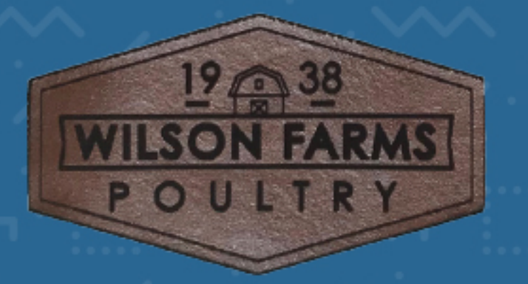
Hex - Wide 3.5" x 2"