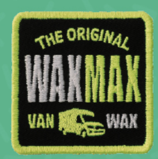
Square - Large 2.5" x 2.5"