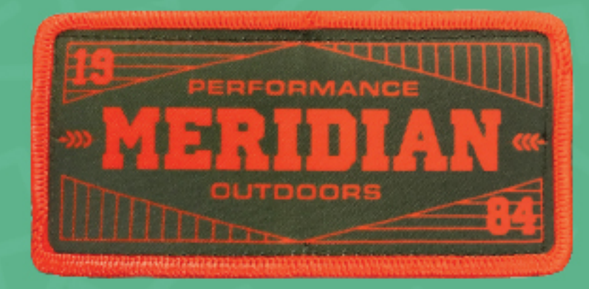
Rectangle - Wide 4" x 2"