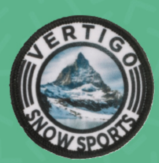
Circle - Large 2.5" x 2.5"