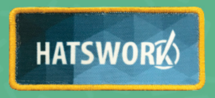
Rectangle - Medium 3.5" x 1.5"