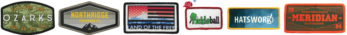
Buckle - Wide 3.5" x 2.25"