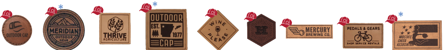
Circle - Mini 1.5" x 1.5"