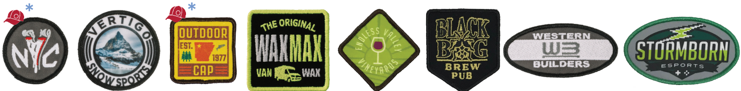
Circle - Small 2" x 2" Sublimated Only